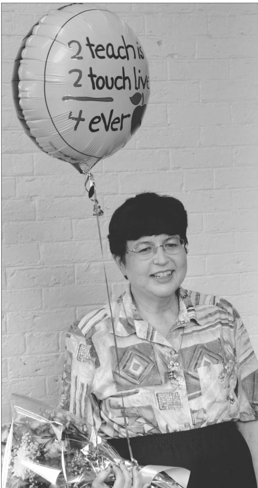
ITEM PHOTO / OWEN O'ROURKE

Ad Council U.S. Department of Transportation